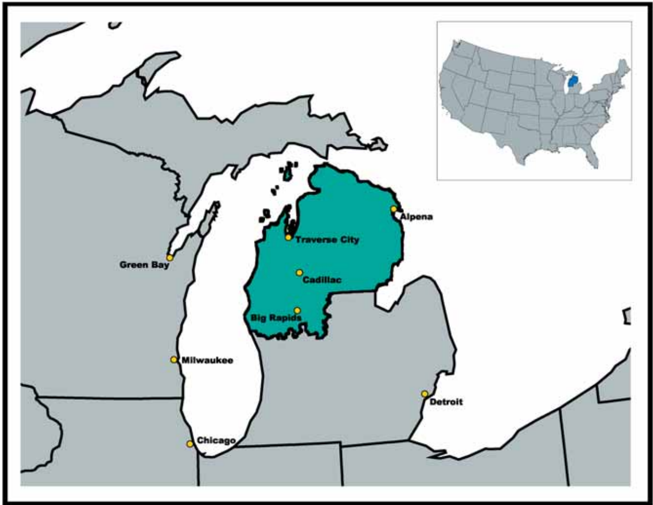
Figure 1. Study area in northern lower Michigan.

houses, or natural resources. The process of setting priorities typically includes a risk analysis involving the determination of the probabilities of severe wildfire in WUI areas and the values at risk of damage or loss.