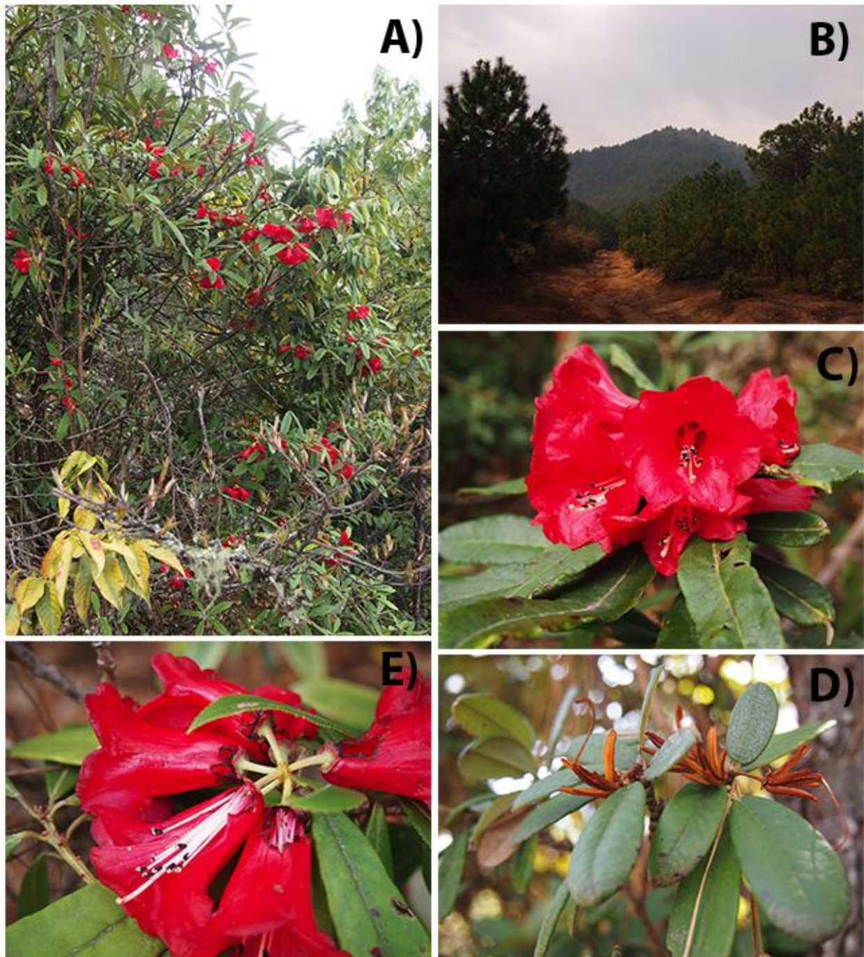
FIGURE 1: A compilation of photographs taken by E.G. in 2012 of R. floccigerum in Weixi: (A) shrub in bloom, (B) R. floccigerum habitat, (C) an inflorescence, (D) last year's capsules, and (E) evidence of robbing, note the holes at the base of the corolla over the nectaries.

basal nectar pouches, and ten stamen, and it flowers between May and June (Wu et al. 2005). The corollas are with or without a darker red basal blotch, or nectar guides (smaller spots that typically lead to a source of nectar), and the flowers are organized in pendant umbels of four to eight flowers, which often fall below the leaves (Fig. 1). The calyx of R. floccigerum is minute, just one to four mm long. It is unknown whether or not R. floccigerum is self-compatible. The floral morphology of R. floccigerum suggests that it is pollinated by birds.